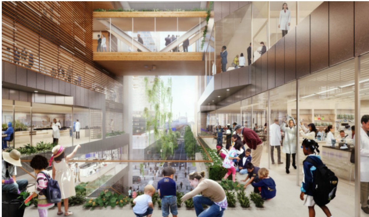
The Wintergarden.

Meanwhile, a 627,000-square-foot office tower, “3101 Market East,” is in line to be built, as is a hotel covering 247,000 square feet.